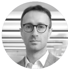
MATTEO ORLANDI ARUP

Emanuela works as senior researcher at CIEMAT. She is specialised in dynamic simulation models of buildings, optimisation of the energy performance of buildings and neighbourhoods, thermal comfort evaluations and climate assessment. She deals with façade technologies characterised by the dynamic behaviour and with embedded solar energy exploitation devices.